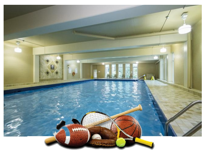
ANY EQUIPMENT LEFT IN THE POOL AREA WILL BE REMOVED AND DONATED TO CHARITY

Many thanks for all the donations of books, magazines, newspapers, puzzles, DVDs and CDs.